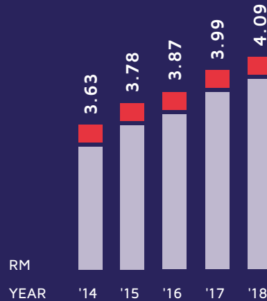
NET ASSETS PER SHARE