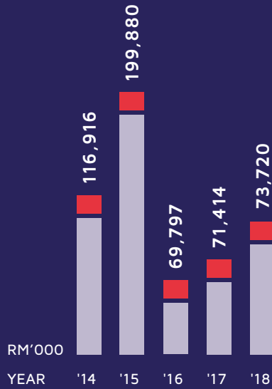
PROFIT BEFORE TAX